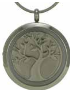
P Pewter Tree Companion J5060