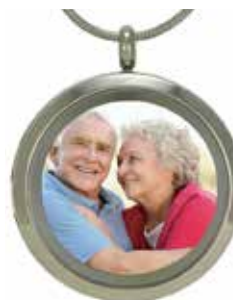
P Pewter Photo Companion J5062