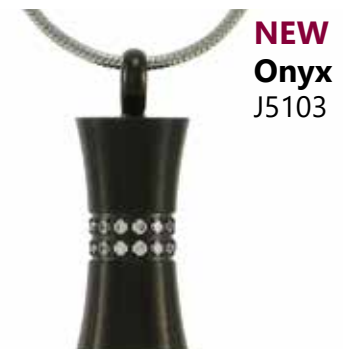
NEW Onyx J5103