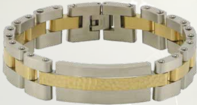
Pewter 14K J5200

Length: 9.0" Width: .68" Depth: .18" Capacity: Nominal