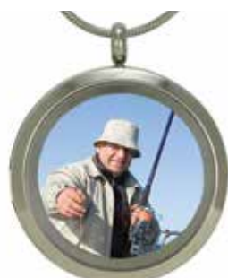
P Pewter* J5053

The Photo option includes a glass insert that helps protect the photo and keep it positioned. The insert can also be used as a template for photo sizing (diameter is 7/8").