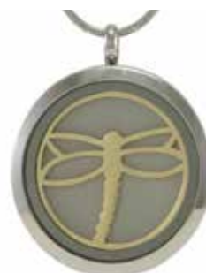
P 14K Pewter/ Bronze J5055