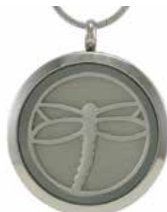
P Pewter J5054