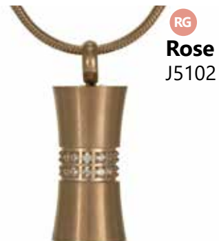
RG Rose J5102