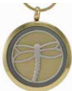
P 14K Bronze/ Pewter J5015