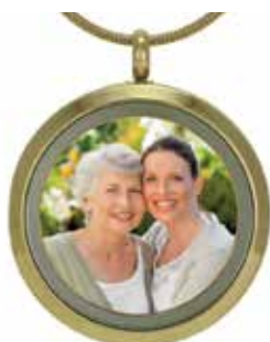
P 14K Bronze* J5013