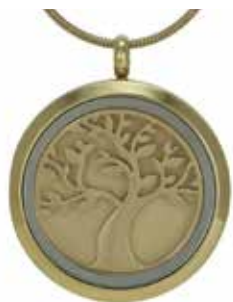
P 14K Bronze Tree Companion J5020