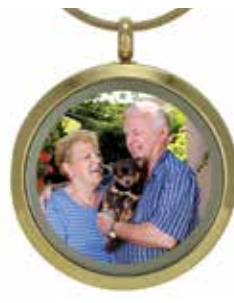
P 14K Bronze Photo Companion J5022