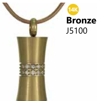
14K Bronze J5100

The hourglass collection is not suitable for engraving.