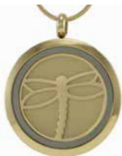
P 14K Bronze J5014